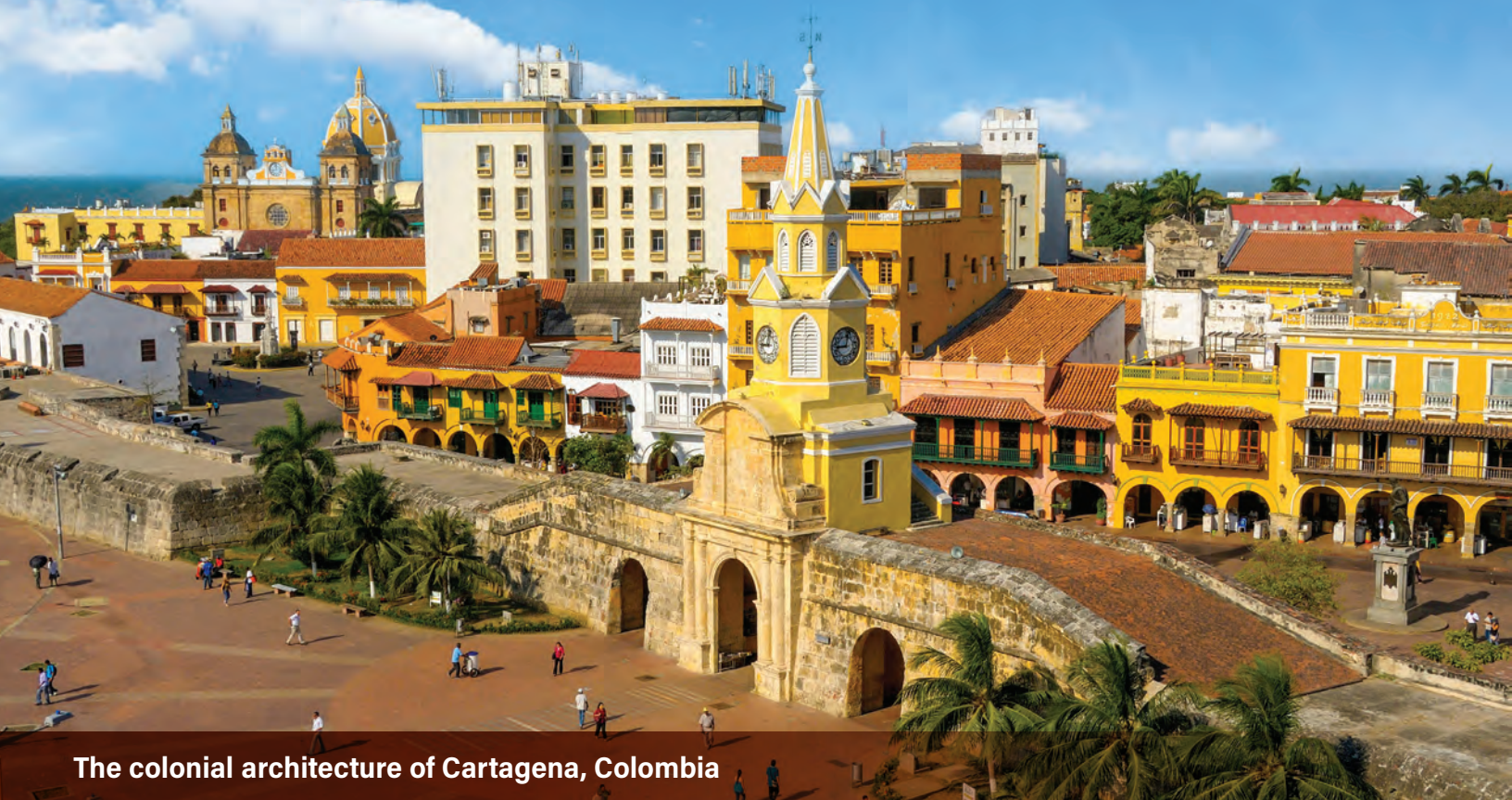
The colonial architecture of Cartagena, Colombia