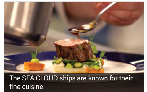
The SEA CLOUD ships are known for their fine cuisine

Built in 2021, the SEA CLOUD SPIRIT is undoubtedly among the world's most unique and beautiful cruise ships. Measuring 452 feet in overall length, and with a beam of 56 feet, SEA CLOUD SPIRIT is an authentic three-mast full-rigged yacht that combines the traditional aspects of ocean-going sailing ships of bygone eras with 21st-century state-of-the-art technologies and amenities. One of the most thrilling experiences aboard is to watch the skilled crew hoist by hand the ship's 28 sails, which cover a total sail area of 44,100 sq ft. When not riding the winds, the ship is powered by diesel-electric engines with low-sulfur marine diesel oil. The combination of traveling under sail and high-quality diesel oil for the engines provides one of the most sustainable cruising experiences available.