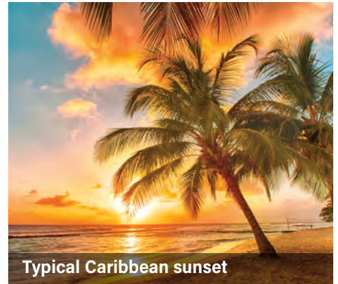
Typical Caribbean sunset