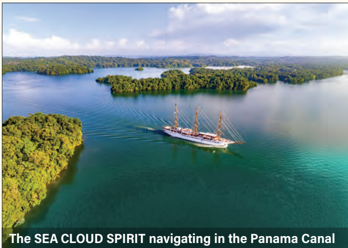
The SEA CLOUD SPIRIT navigating in the Panama Canal

After breakfast, disembark in Colón, the eastern terminus of the Panama Canal. Transfer westward via coach from Colón towards Panamá City with stops enroute for lunch and at points of interest along the Panama Canal. Since its completion in 1914, this masterpiece of engineering has become one of the world's most significant commercial waterways. The varied aquatic ecosystems that surround the Canal are vital to its systemic function, providing the enormous quantities of fresh water necessary to operate its massive hydraulic locks. In the evening, transfer to the Hotel Hilton Panamá (or similar) in Panamá City for a one-night stay and a final dinner together before flights homeward on February 18. (B, L, D)