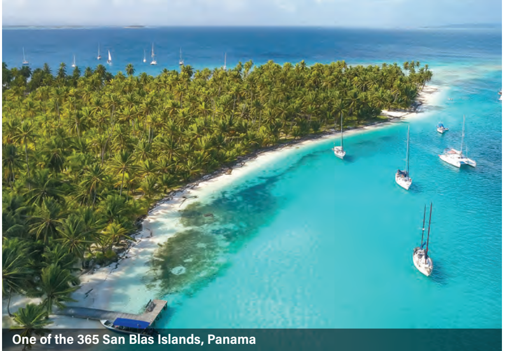
One of the 365 San Blas Islands, Panama

Travelers can expect to walk an estimated total of 2-4 hours per day. Nature excursions may involve navigating uneven, slippery, rocky, or inclined terrain, unpaved paths, or steps without handrails. Standing may be necessary if seating is not available during excursions, and embarking/disembarking the ship and motor coaches will be necessary. Guests should also be comfortable climbing into and out of motorized Zodiacs for shore excursions, which may involve wet landings, so sure footing and good balance are important. Opportunities to swim and snorkel are likely, time permitting. Conditions may be hot and humid, so appropriate clothing, sun and bug protection, and a spirit of adventure will help you get the most from this incredible voyage. There is no elevator aboard the ship and travelers use stairways with railings while on board.