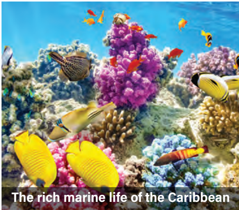
The rich marine life of the Caribbean