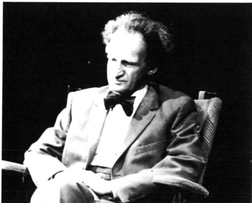
Croiset gained fame as a clairvoyant sleuth.